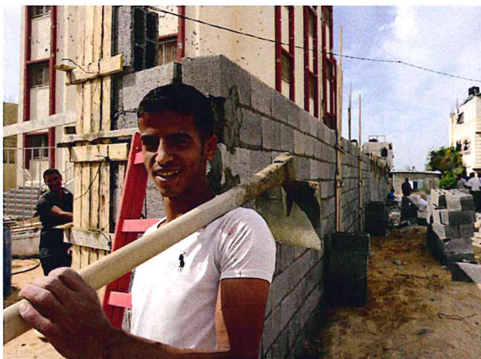
A CRS cash-for-work project employs people to help rebuild a destroyed kindergarden.

CRS applies rigorous vetting and accounting policies and procedures in compliance with USAID and the local authorities. CRS remains vigilant and informed of the identity and backgrounds of all those who serve our beneficiaries. Additionally, CRS conducts systematic financial and internal controls assessments of all our partners. These risk-mitigation practices enable us to screen and monitor the people, businesses and civil society organizations we work with in Gaza.